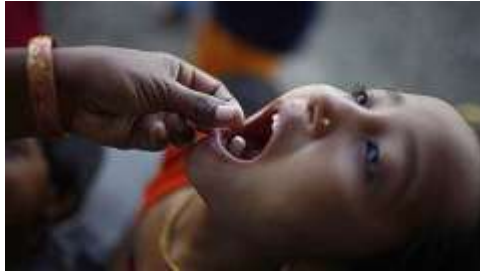
Child receiving generic drug.