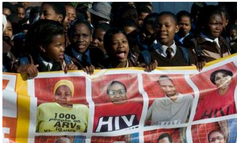
Students in Capetown, South Africa, march to increase distribution of cheap ARVs.

Even with this progress, there remains a dark cloud on the horizon, particularly for HIV/AIDS drugs. The patents for many first-line AIDS drugs have expired, and countries such as India are ferociously producing them at low prices. However, the new second-line medicines are still under tight patents. These new drugs are often better and less toxic than old first-line drugs, making them about six times as expensive. When patients experience resistance or toxicity, second-line treatment options are necessary to better fight the virus. Patients in developing nations are unable to get these drugs and are forced to stick to older treatment options. 3